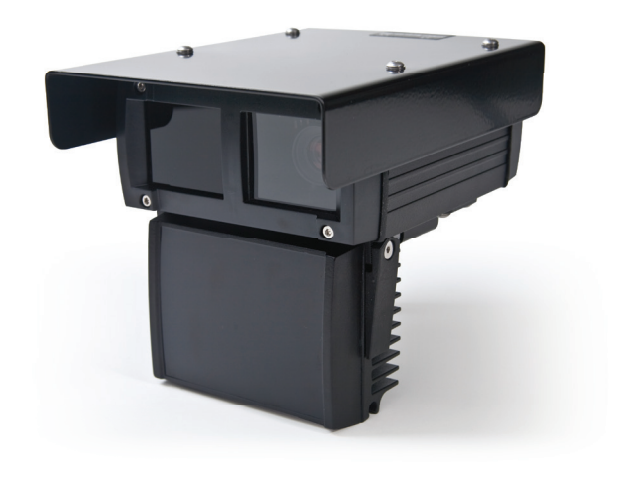
LPR Camera with Integrated Overview Camera Provides Image for CCTV